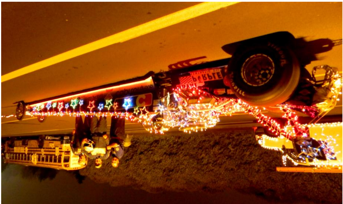
Rich Bailey's dragster looked very festive at the Keizer Festival of Lights Parade